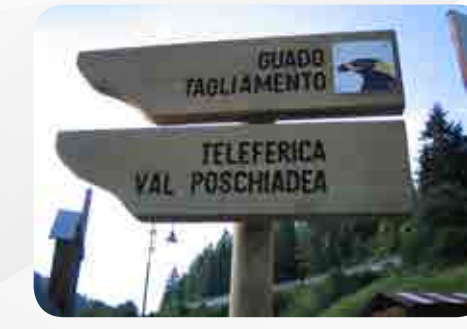
Pramaggiore mount and mountain pass Passo Suola