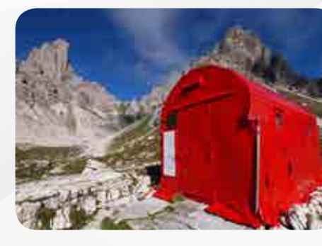
Ridge Cresta del Leone