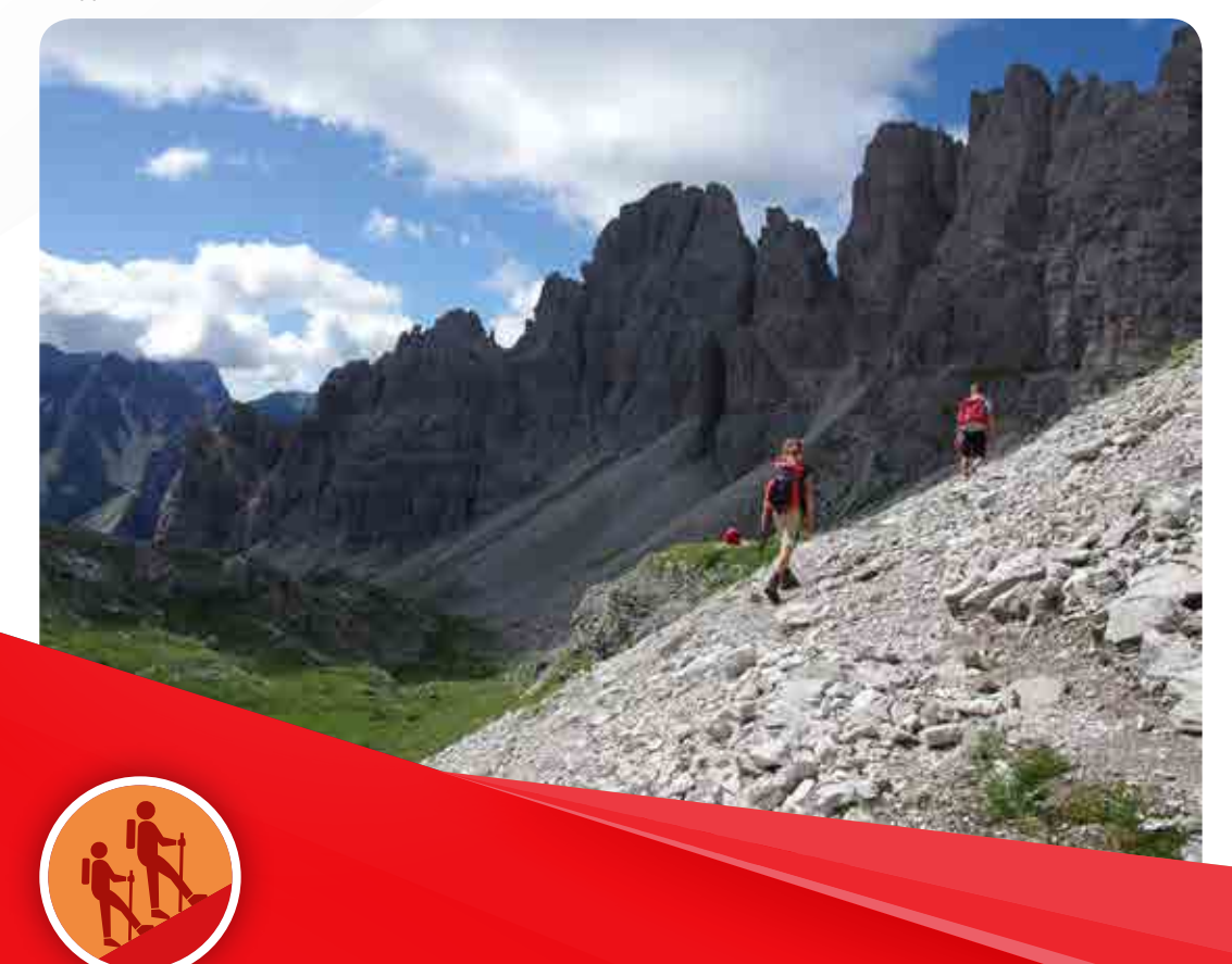
Monfalconi di Forni

Upper Val Monfalconi di Forni and Granzotto Marchi bivouac