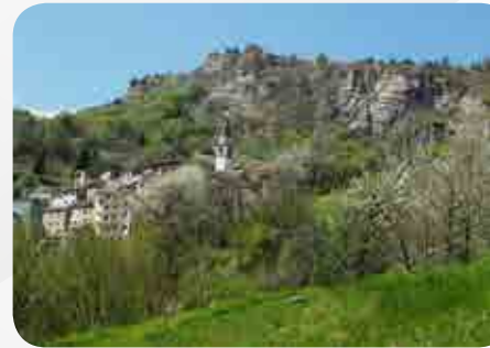
Details of Casso