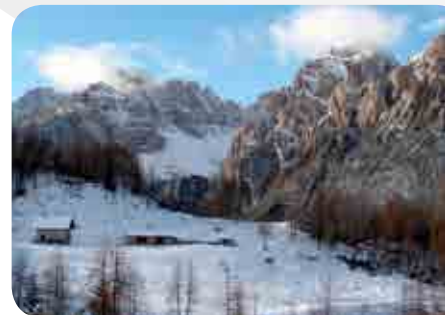
Towards the saddle of Urtisiel